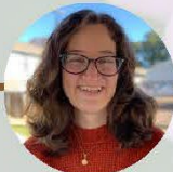
Research Associate II Horticulture