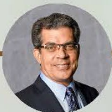
Department Head & Professor Horticulture