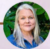
Associate Professor Horticulture