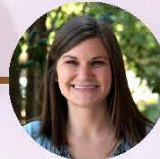
Associate Professor Crop, Soil & Environmental Sciences